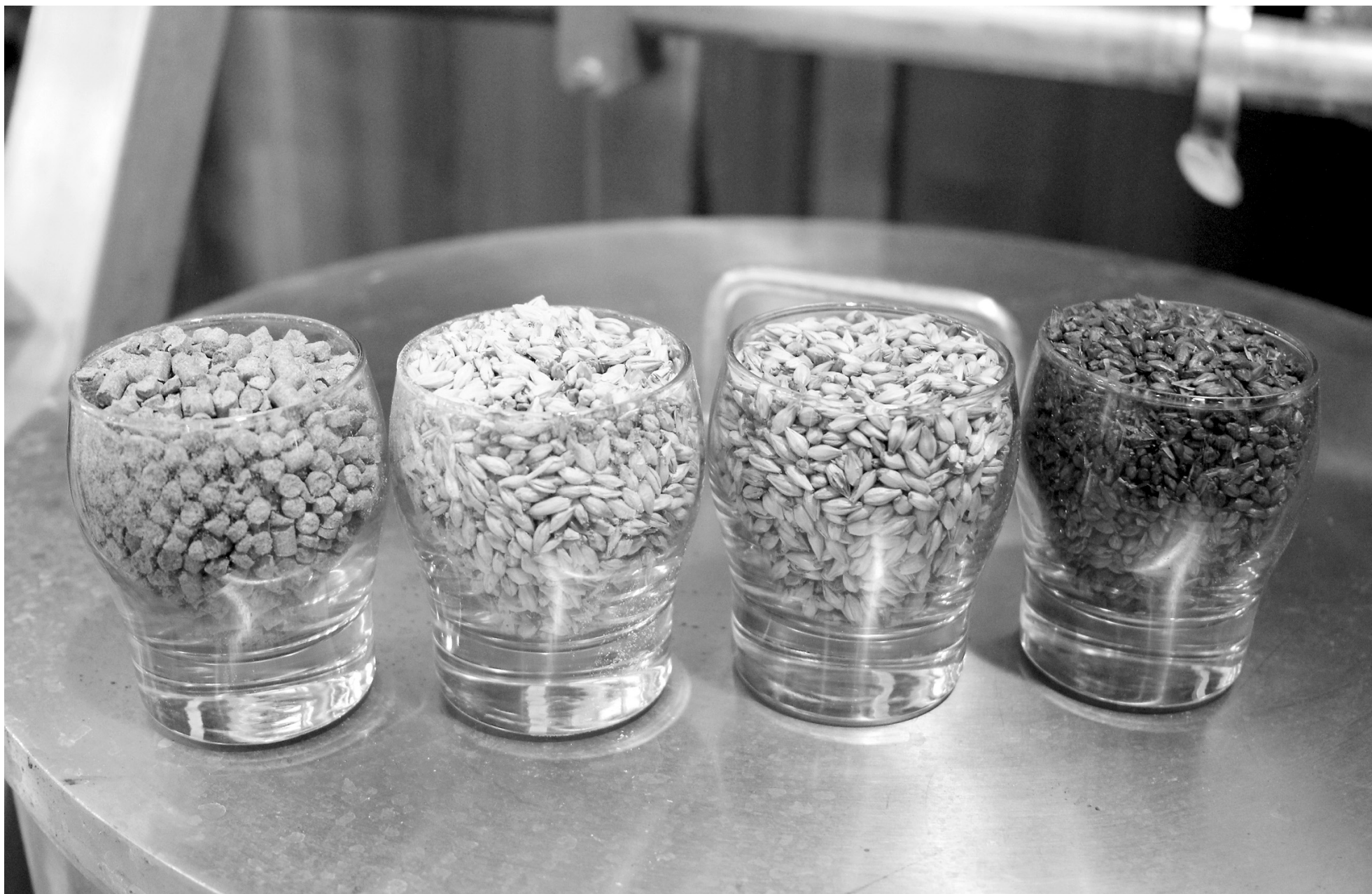
Bold City Grains