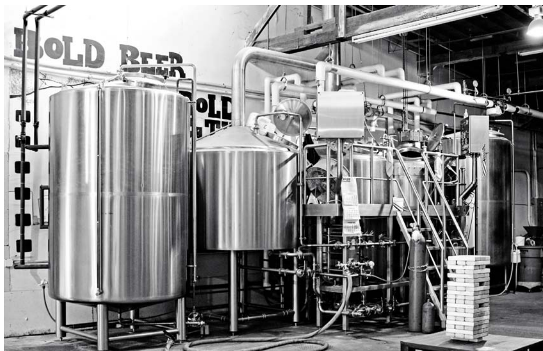
Bold City Tanks

The Jax Brew Bus guys informed us that Duke’s Cold Nose Brown Ale and Killer Whale Cream Ale are the two Bold City brews one is likely to find all over town. The Duke’s was a nice balance of body and sweetness, and it’s easy to see why it’s so popular. Another thing that makes Bold City unique is their wide