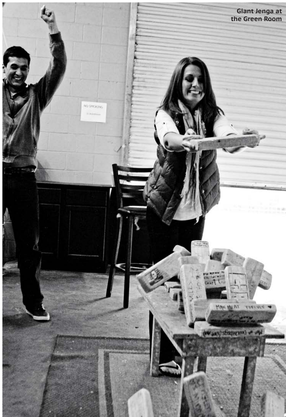
Giant Jenga at the Green Room